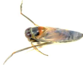
Backswimmer Page 48

Back is often white, belly is dark, swims upside down